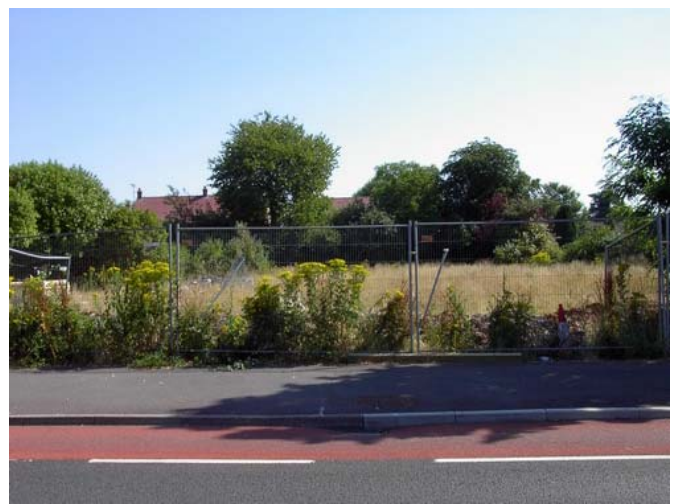
The picture above shows the site in the article above.

It was done before the government was insisting on the very high housing density now required. The Parish Council is supporting other parish councils in asking for there to be a rural exemption to this requirement.