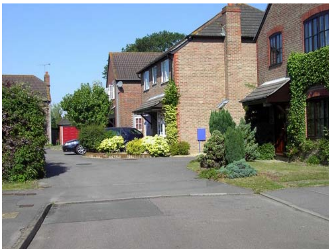
Ludcombe, above, is an early example of back garden infilling.

It was done before the government was insisting on the very high housing density now required. The Parish Council is supporting other parish councils in asking for there to be a rural exemption to this requirement.