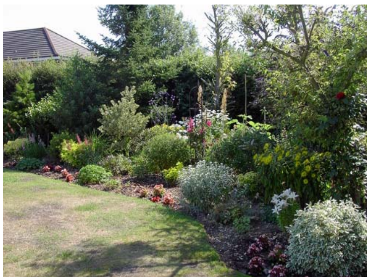
The garden in a corner of Denmead Bowling Club grounds.

In Tudor times a number of large houses were given moats not for defence but to act as fishponds. The absence of a reference to fishponds in the Enclosure Acts suggests the ponds are of 19th century origin - and perhaps once belonged to a family called Monk?